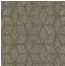
Enriched Wisdom 77330