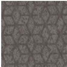
Refined Eleganc 77585