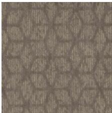
Warm Intentions 77761