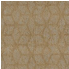
Humble Beginnin 77155