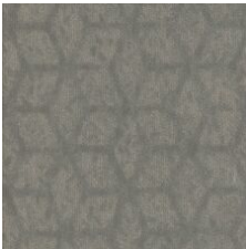
Self Reflection 77484