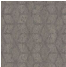
Major Milestone 77515