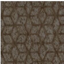
Express Gratitu 77740