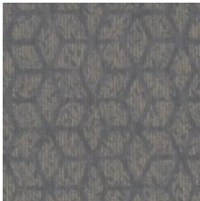
First Impressio 77402